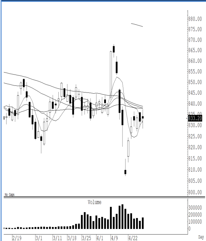
S50M24 (Close 833.20 Chg 1.30)